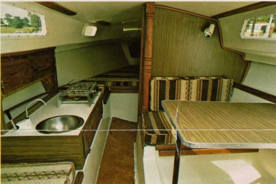
Photographs may illustrate optional equipment, for information and prices contact your dealer